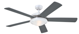
Reversible Graphite Finish Blades